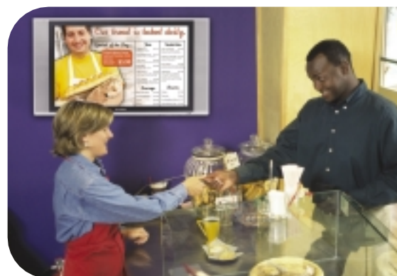
The N3000w brings brilliant pictures and versatile signage and powerful sound to your business.

you are connected to your DVD, VCR, set-top box or camcorder. Dual TV tuners also give you full picture-in-picture (PIP) capability and great TV viewing features. Plus, you can also use the N3000w as a high-definition LCD display with stunning color, brightness and high-contrast images.