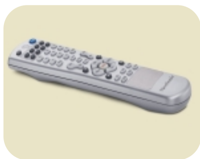
This 44-key remote puts control in the palm of your hand.

Ultra-high brightness of 450 nits (typ) and a high contrast ratio of 400:1 (typ) bring you rich, saturated color images and crisp text.